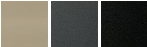
GF11 titanium embossed