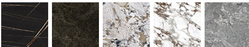
KM09 glossy Sahara Noir