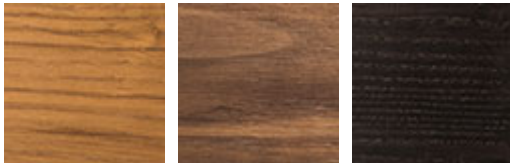
HR Heritage oak